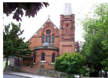
St Joseph's Catholic Church, Shooters Hill

If you cannot attend mass, please visit our website , and click the Donate button. If you are a taxpayer, please remember to tick the 'Gift Aid' box. God bless, Ave Maria.